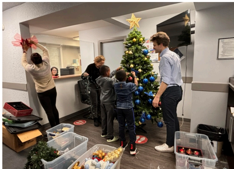
Staff and volunteers sharing holiday traditions with new Canadians